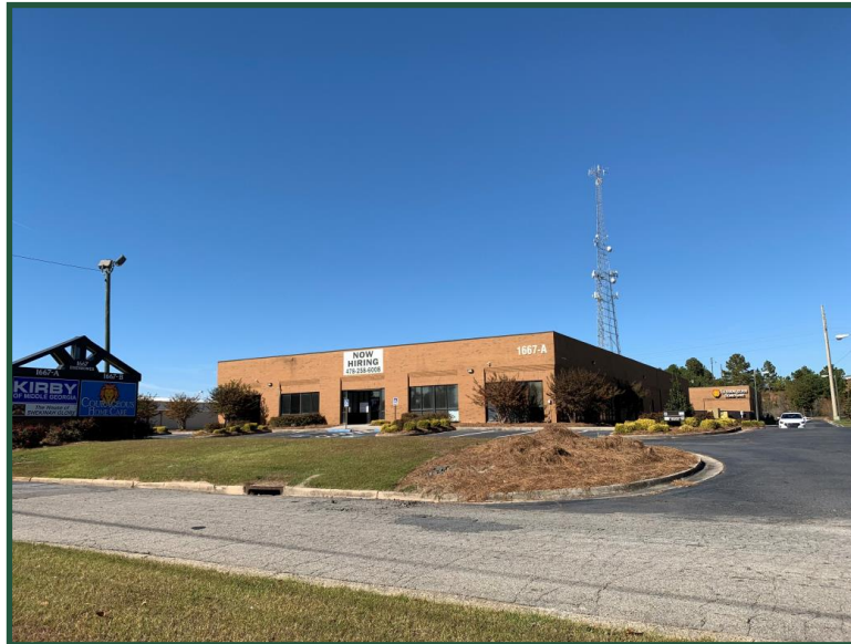
Building A Front