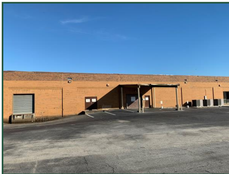
Building A Side with Roll-Up Door