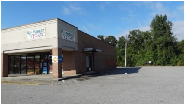
Side of Building