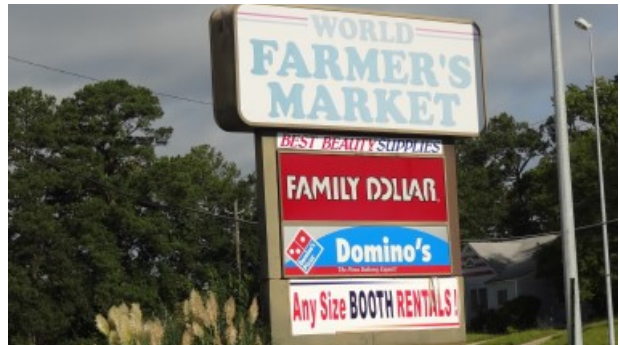
Signage on Mercer Univ. Dr.