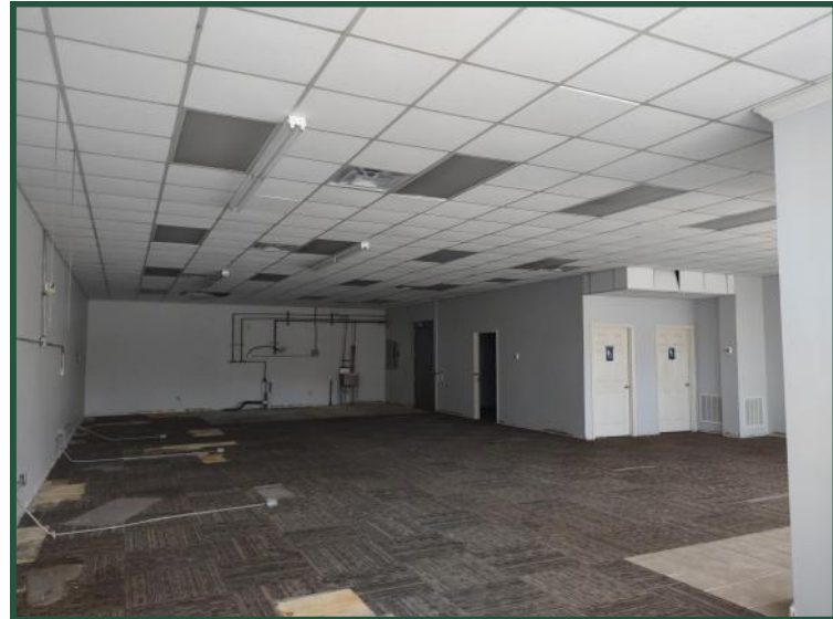
Suite A Interior - From Front