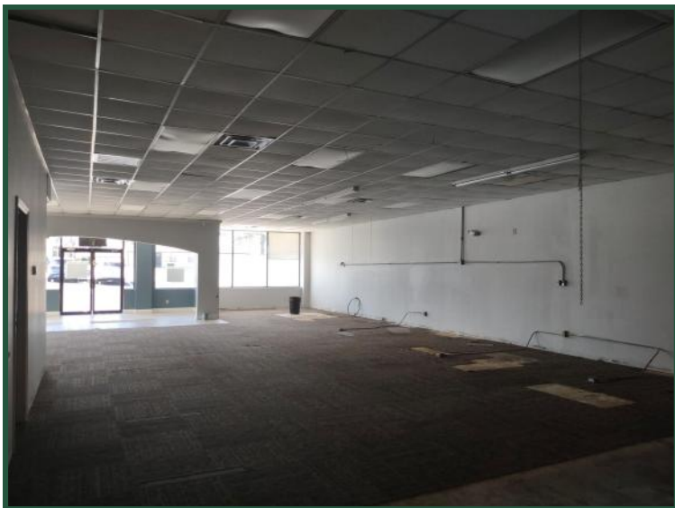
Suite A Interior - From Rear