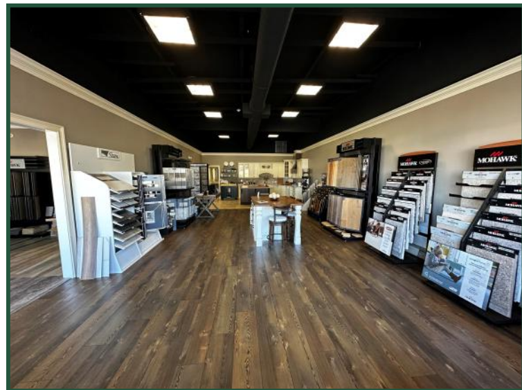
Suite B Interior - From Front