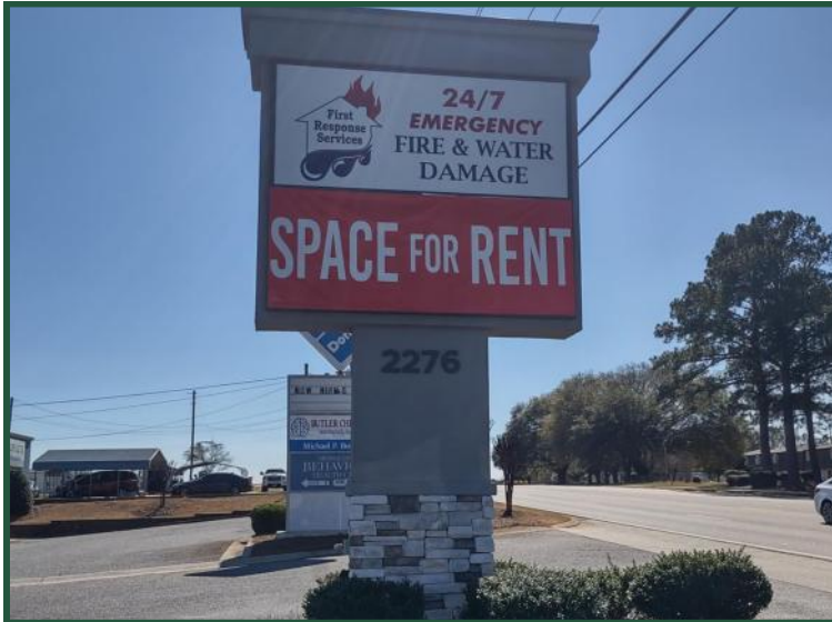
Exterior - Monument Sign