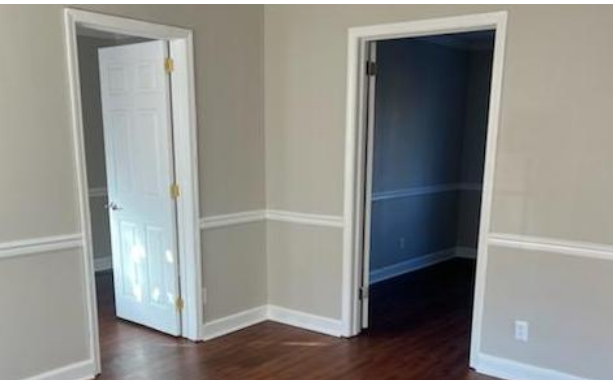
Building C - Suite 103