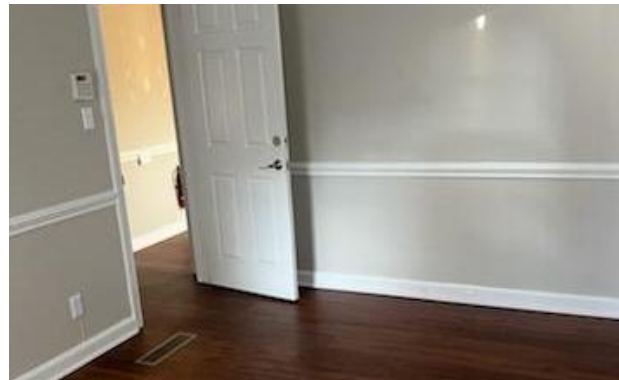
Building C - Suite 104