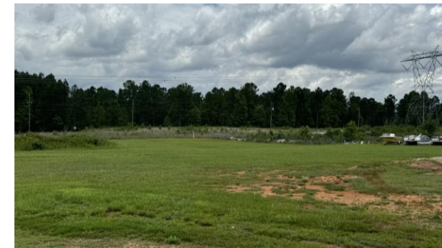
Additional Acreage for Expansion ( approx. 2 acres)