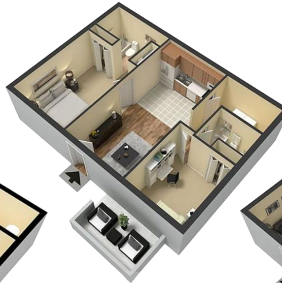
Two Bedroom, One Bath