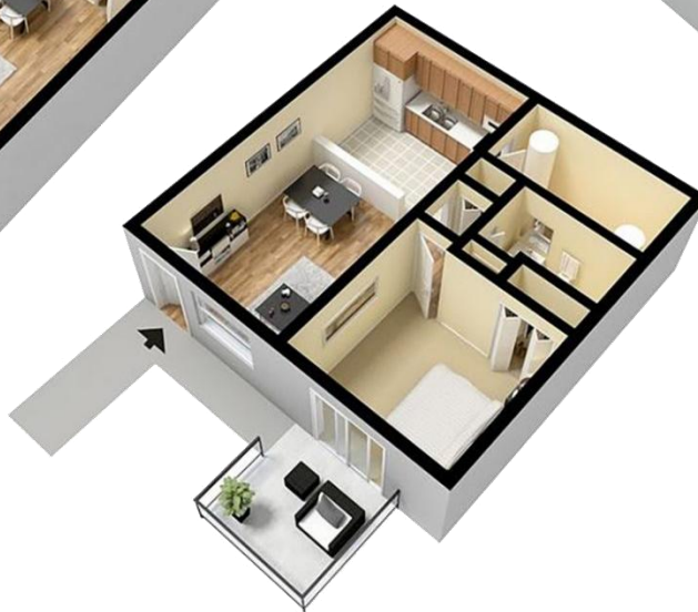
One Bedroom, One Bath