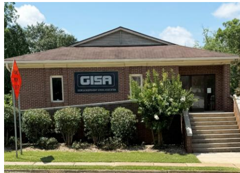
2 nd Floor Entrance

This 5,412 SF two-story office building is situated on a 0.26 Acre corner lot. The first floor is 2,530 SF and is comprised of 5 offices, 2 restrooms, lobby, conference room, break room, file room, storage room, and work room. The second floor is 1,332 SF and is comprised of 5 offices, 1½ restrooms, reception, lobby, storage, and a nurse room. Property was renovated in 2001, roof was replaced in 2010. Ideal for medical or professional office. Individual floors utilities are separately metered.