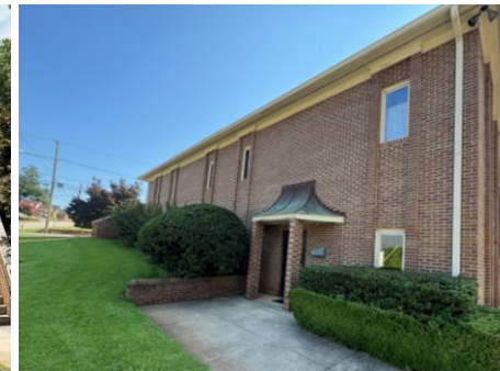
1st Floor Entrance