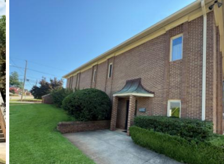
1 st Floor Entrance