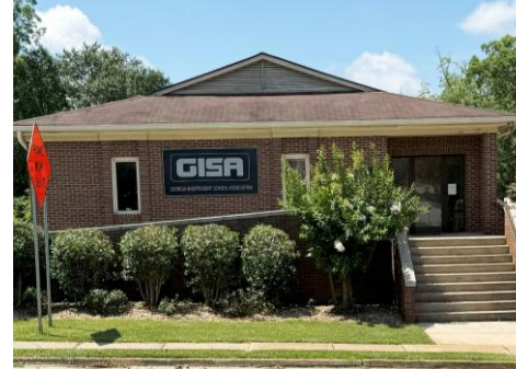
2 nd Floor Entrance

This 5,412 SF two-story office building is situated on a 0.26 Acre corner lot. The first floor is 2,530 SF and is comprised of 5 offices, 2 restrooms, lobby, conference room, break room, file room, storage room, and work room. The second floor is 1,332 SF and is comprised of 5 offices, 1½ restrooms, reception, lobby, storage, and a nurse room. Property was renovated in 2001, roof was replaced in 2010. Ideal for medical or professional office. Individual floors utilities are separately metered.