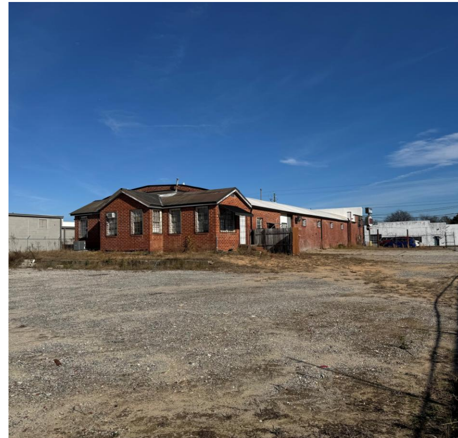
Rear View of Building

This warehouse is located in a great industrial corridor in Macon, with great neighbors. Corridor is located close to Highway 80 (Eisenhower Parkway) and I-75 to the north and Highway 247 to the south. Also convenient to downtown Macon. Neighboring businesses include Olivers Auto & Truck Repair, Rush Truck Centers, Cassidy Machine Shop & Engine, Siding Supply Inc, and Fleet Pride Walthall, as well as many other light industrial businesses.