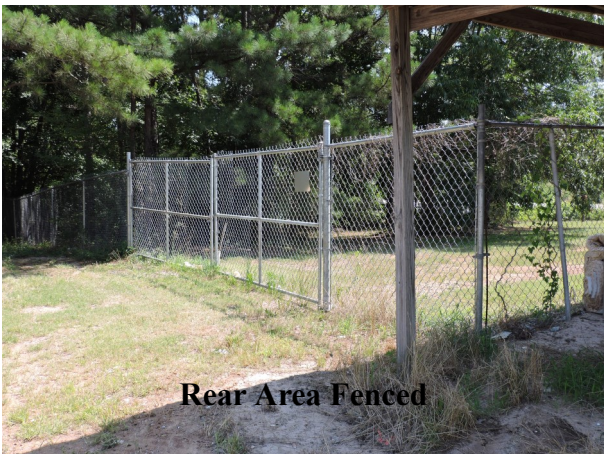
Rear Area Fenced