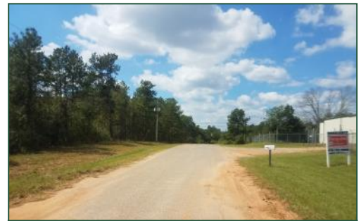
2445 Spires Drive