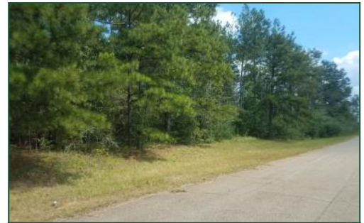
2400 Spires Drive