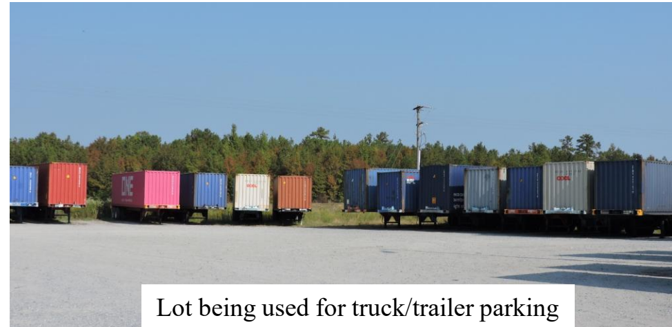
Lot being used for truck/trailer parking

The Fall Line Freeway (State Route 540) is a 215-mile-long highway from Columbus, GA to Augusta GA. Also known as the “Middle Georgia Corridor.” Site is just minutes away from both Gordon, GA and Ivey, GA. Nearby businesses include International Paper, Zschimmer and Schwarz, Inc., Sellers Construction, Active Minerals, Industrial Steel and Machinery, ISP Alliance, and industrial businesses.