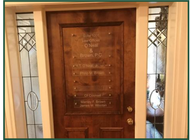
Office Front Entrance