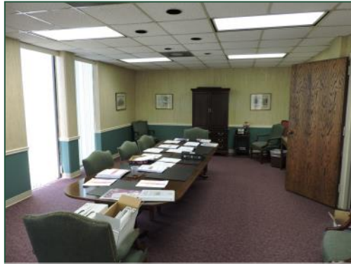
Shared Conference Room