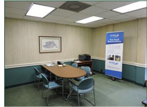
Executive Office -Suite 202