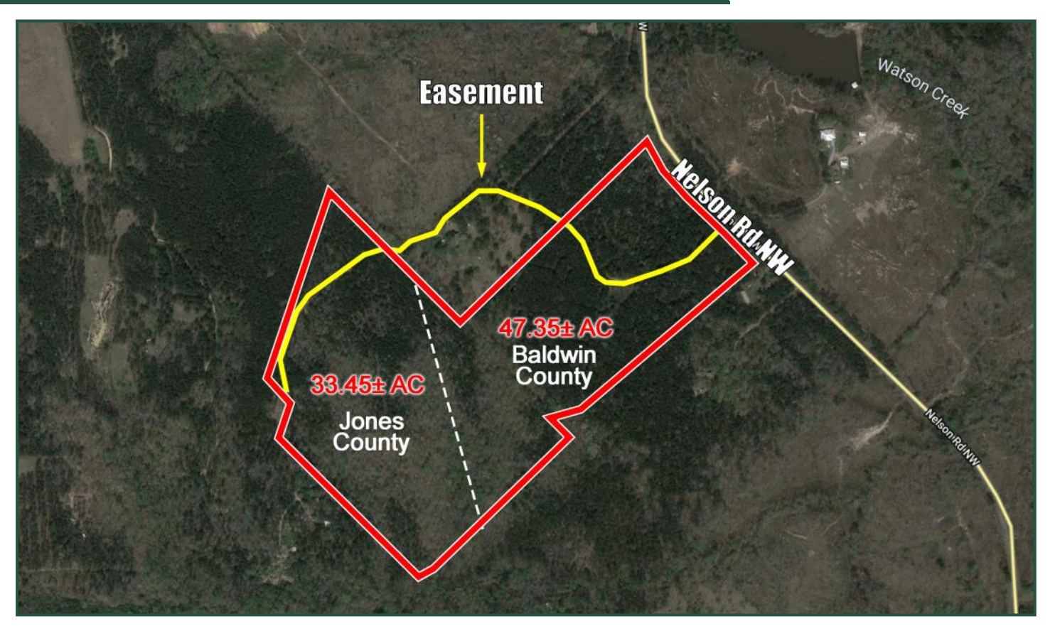
LOT SIZE: 80.746± (2 Lots sold together)