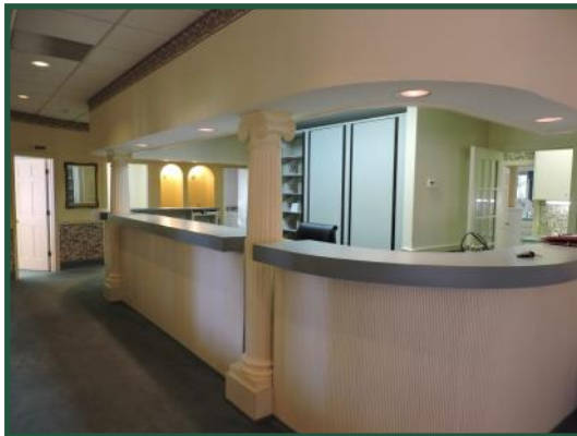
First Floor Reception Desk