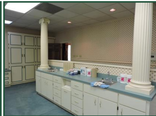
Open Treatment Area