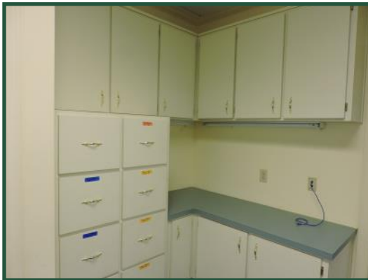
Insurance Filing & Storage