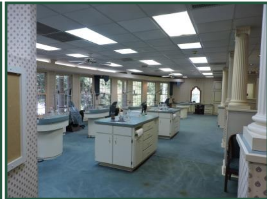
Open Treatment Area