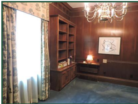
Physician's Private Office