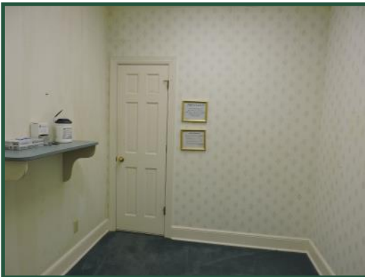
Treatment Room - X-Ray

A Full Service Real Estate Company commercial.fickling.com