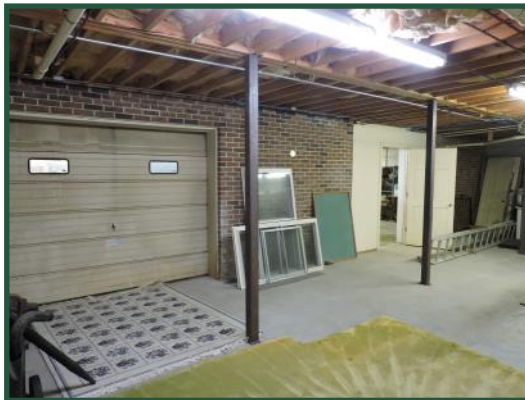
Basement General Storage