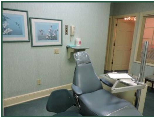
Private Treatment Room