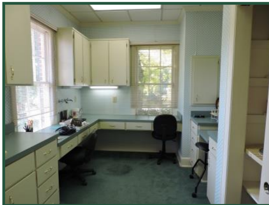
First Floor Main Lab