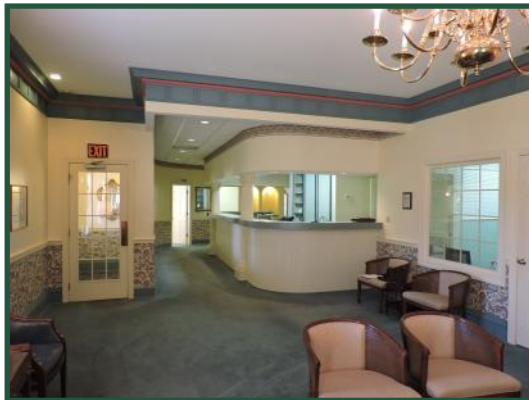
First Floor Reception & Lobby

A Full Service Real Estate Company commercial.fickling.com