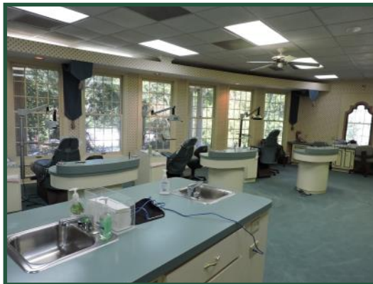
Open Treatment Area