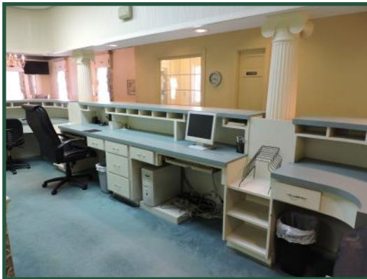
First Floor Reception