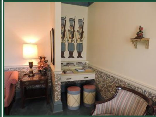
Lobby Children's Corner