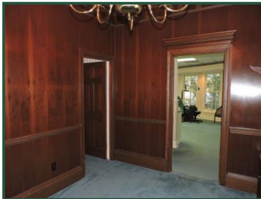
Physician's Private Office