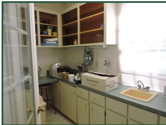
First Floor Main Lab