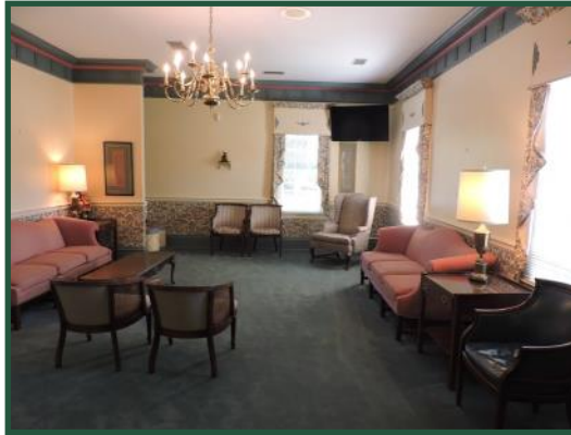
First Floor Lobby