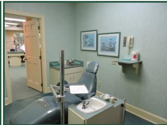
Private Treatment Room