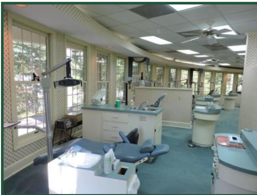
Open Treatment Area