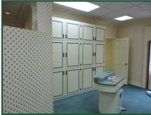
Open Treatment Storage