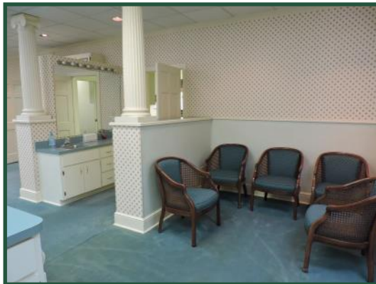
Open Treatment On-Deck

A Full Service Real Estate Company commercial.fickling.com