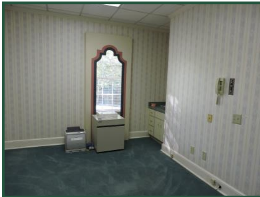
Private Treatment Room