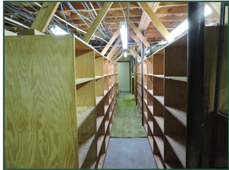
Storage and exposed plumbing