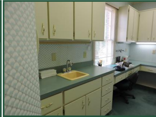
Private Treatment Room