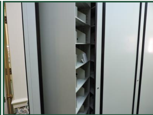
Reception Filing System